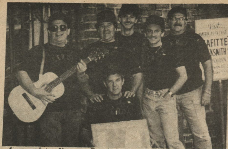
A new sister Krewe, Cerci, having its 1st fund raiser at Lafitte's Blacksmith Shop. Good Luck!

Member of Club Bath Chain 504/581-2402 515 Toulouse Street • New Orleans, Louisiana