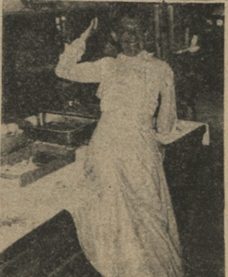
The Pride of Petronius "Cha Cha" displays one of the gowns she purchased from the "better dress department"—at the Club's rummage sale at the Gally House. December 16, 1983, Impact, Page 31

TRADE OR RENT: CARNIVAL HOUSE? Young professional couples want trade/rent furnished for March 2—8. Offer two Bedroom, fireplace, two-floor charming mini-chateau in Hollywood Hills—or modern two-bedroom w/pool lanai apartment in Palm Springs—or 1-bedroom, ocean view in Laguna. Details traded by mail. We need two or three-bedroom house/apartment in Quarters for our sixth visit—have local references there. Please write Gregg Barnette, 3488 Floyd Terrace, Hollywood, Ca. 90068